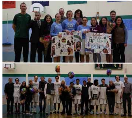
OES honored their senior basketball players on Senior Night. Congratulations to the Seniors and their families!