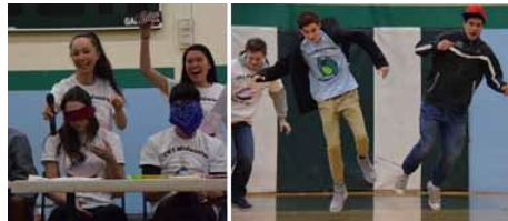
Midwinter Madness kicked off February 2nd. This year, money raised will go to The Seed School.