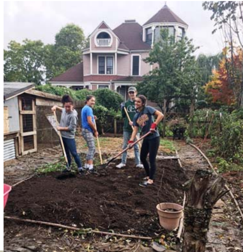
SLOctoberim students working at Albertina Kerr/Port City.