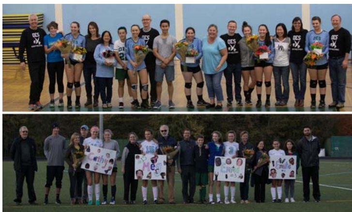
Ladies Soccer and Volleyball Seniors and their families were honored during their respective Senior Nights.